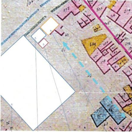
Château féodal, Maison de François de Laudun, Maison de Blaise Bigne sergent. L'église Sainte-Foy Emplacement probable de l'ancienne église de Sainte-Foy d'après les actes notariés.

The original castle on the hill of Ste Foy consisted of a keep and at least one upper floor, accessed by a stone staircase. It certainly served as a dwelling and watchtower.