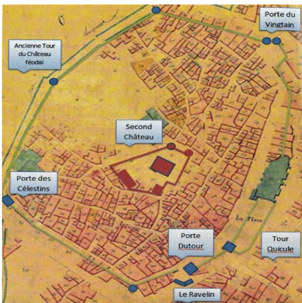
Les Remparts, les 8 tours, les 3 portes et le ravelin du bourg de Sainte-Foy. Au centre, le second château « le Castellias » avec ses deux tours

The ramparts around the town consisted of 8 towers